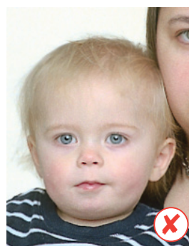
Shows another person