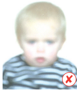
Blurred or too light

Please note photographs become part of the official records of the UKPS and will not be returned. Photographs with a copyright warning attached will not be accepted. For example, school photographs.