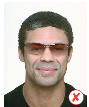
Dark tinted glasses